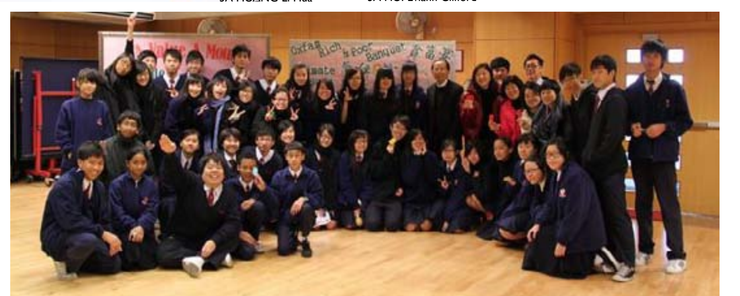
Oxfarm Rich and Poor Banquet

aroused the awareness of environmental protection and helped students learn to treasure everything we have in Hong Kong. They understood the importance of conservation and felt that people of Hong Kong should act promptly to reduce their carbon footprint.